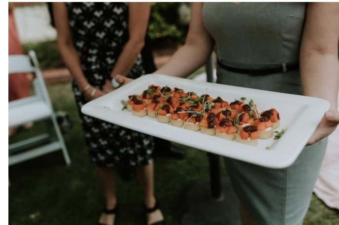
Canape platter options on the Following Page